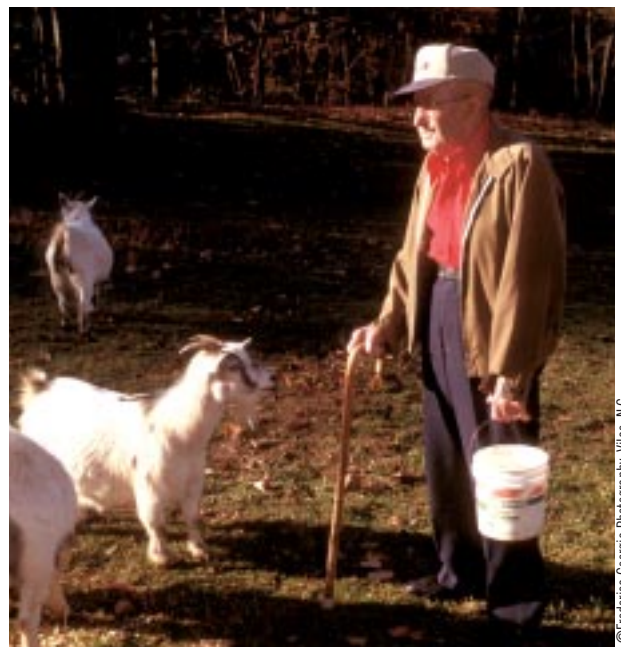
He tends a menagerie of animals at his place on Boone Mountain.