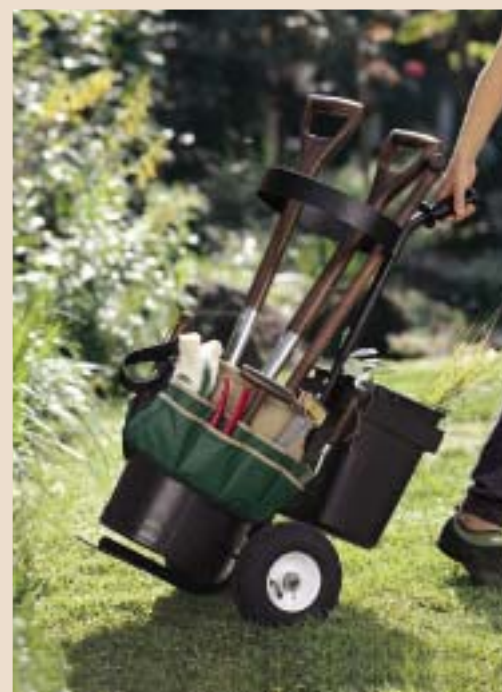
Garden Tool Caddy totes long and short tools.

“bump.” The handles telescope, making a convenient length for anyone to use, and the weight is moderate: only 6.5 pounds. The trimmer is sold with two 18-volt batteries and a charger. $99.99.