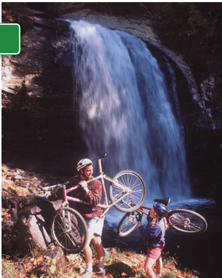
Popular Looking Glass Falls, not far from Brevard, features a 65-foot drop.

There are many other waterfalls throughout the county that are worth a look, including some of the most