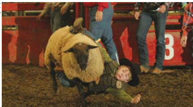
Junior SRA rodeo events at the Love Valley Arena feature children performing barrel racing, pole bending, bull riding and more.

(704) 592-2299 lovevalleynance@aol.com www.lovevalley.com